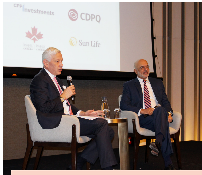
Dominic Barton, Chairman of Rio Tinto and Chair Emeritus of ABLAC, and Piyush Gupta, CEO of the DBS take questions from the ABLAC membership.

Council Members agreed that geopolitical and economic uncertainty will shape Canada's regional approach. They highlighted a series of risks expected to shape Canada's presence in the region, including Russia's invasion of Ukraine, COVID-19 impacts on the workplace, slower global growth, inflation, China-U.S. competition, global supply chain shifts, cyber risks, and regulatory differences. Members reiterated that Russia's invasion of Ukraine has implications for energy, food, and critical minerals security, while waves of COVID-19 impact production and the workforce, with 'stop-start' challenges affecting workplace dynamics. Russia's aggression in Ukraine and COVID-19 will ultimately contribute